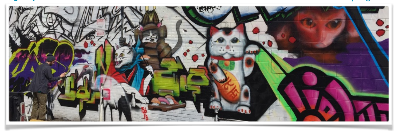
Broken City Mural - Big Kitty/ 156 / Voltron Collaboration